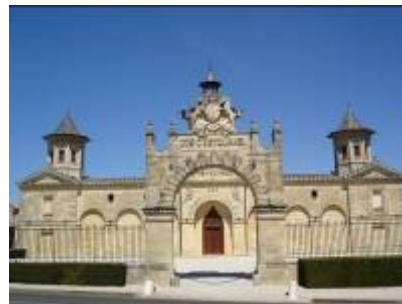
Châteaux Cos D'Estournel

12.30: Lunch in Pauillac, traditional restaurant facing the port of Pauillac.